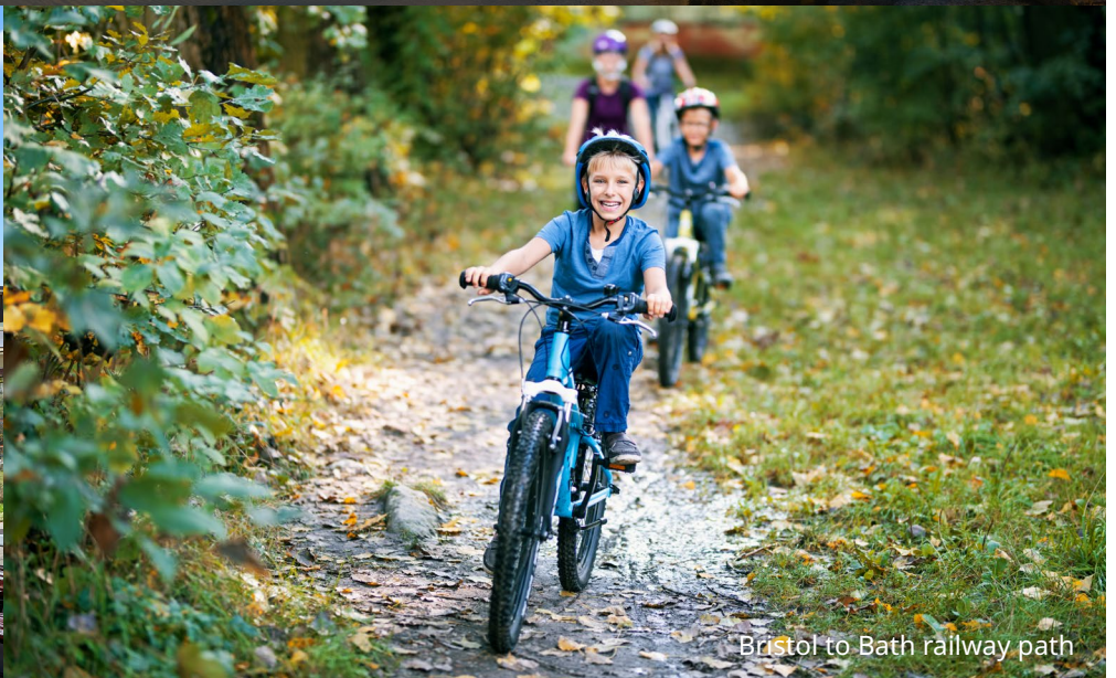
Bristol to Bath railway path