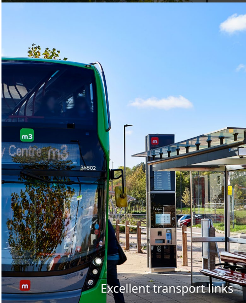
Excellent transport links