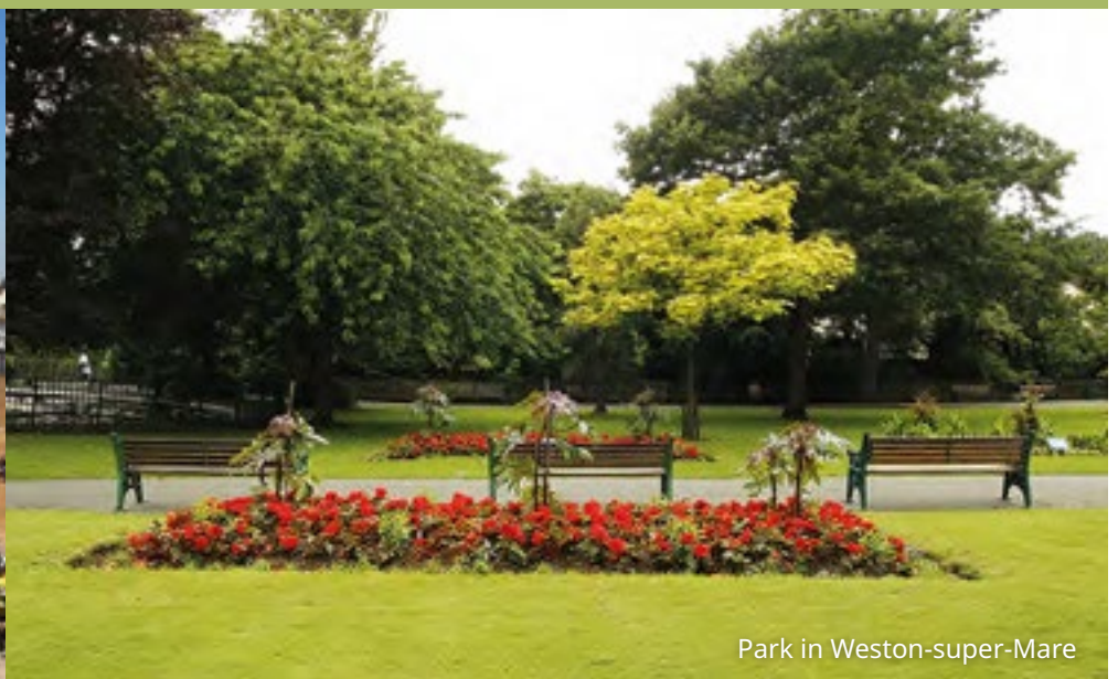
Park in Weston-super-Mare