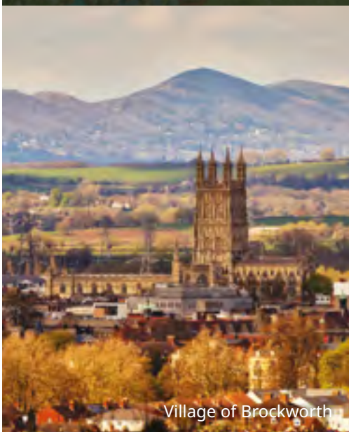
Village of Brockworth