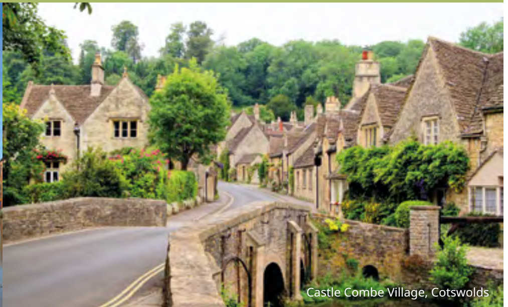
Castle Combe Village, Cotswolds