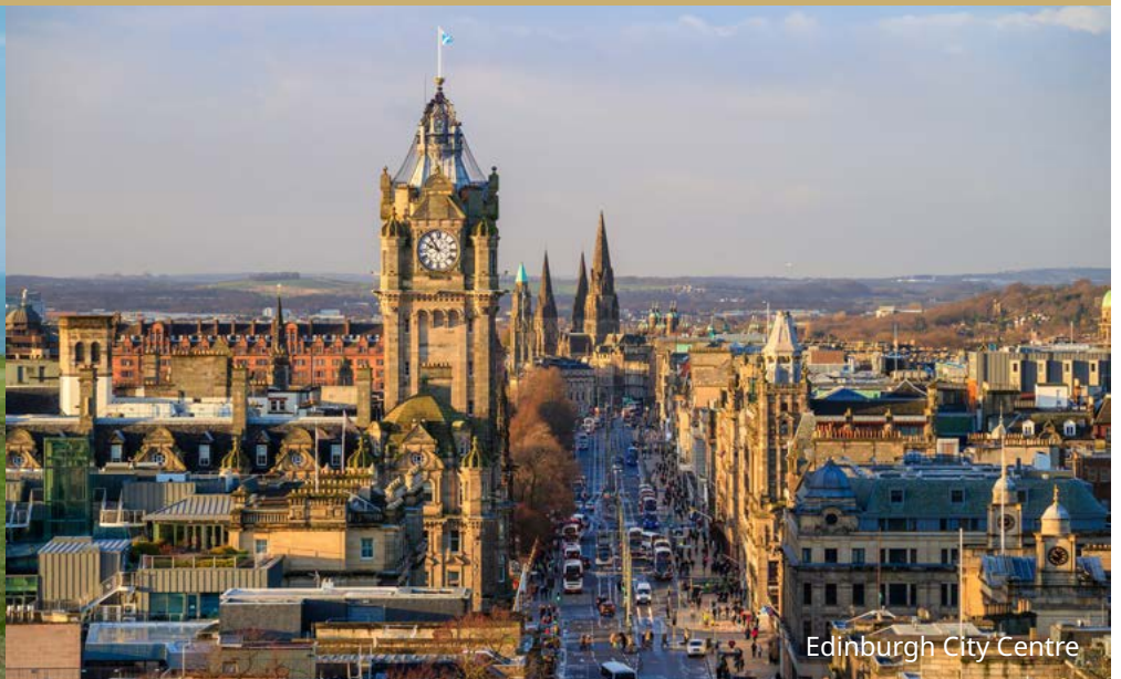
Edinburgh City Centre