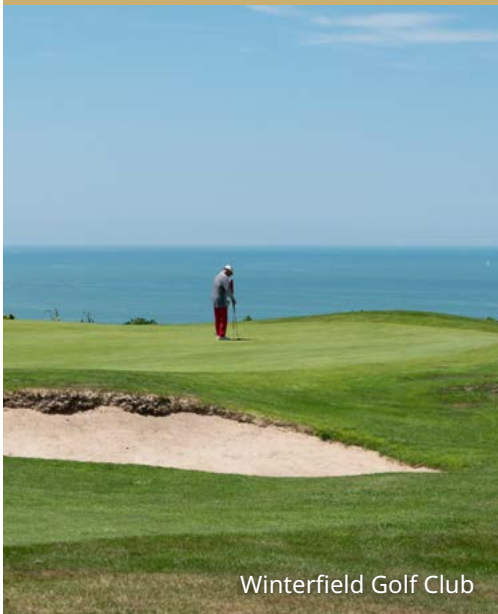
Winterfield Golf Club