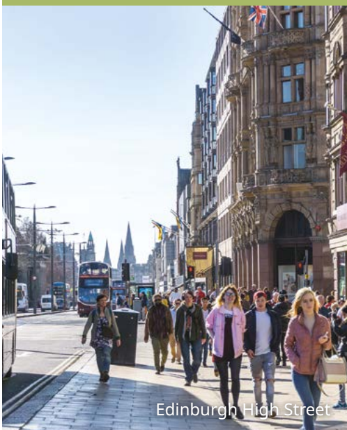
Edinburgh High Street