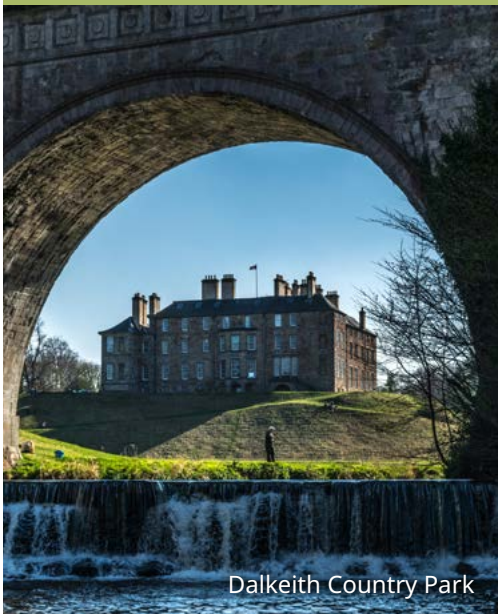
Dalkeith Country Park