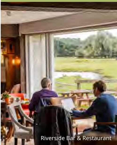
Riverside Bar & Restaurant