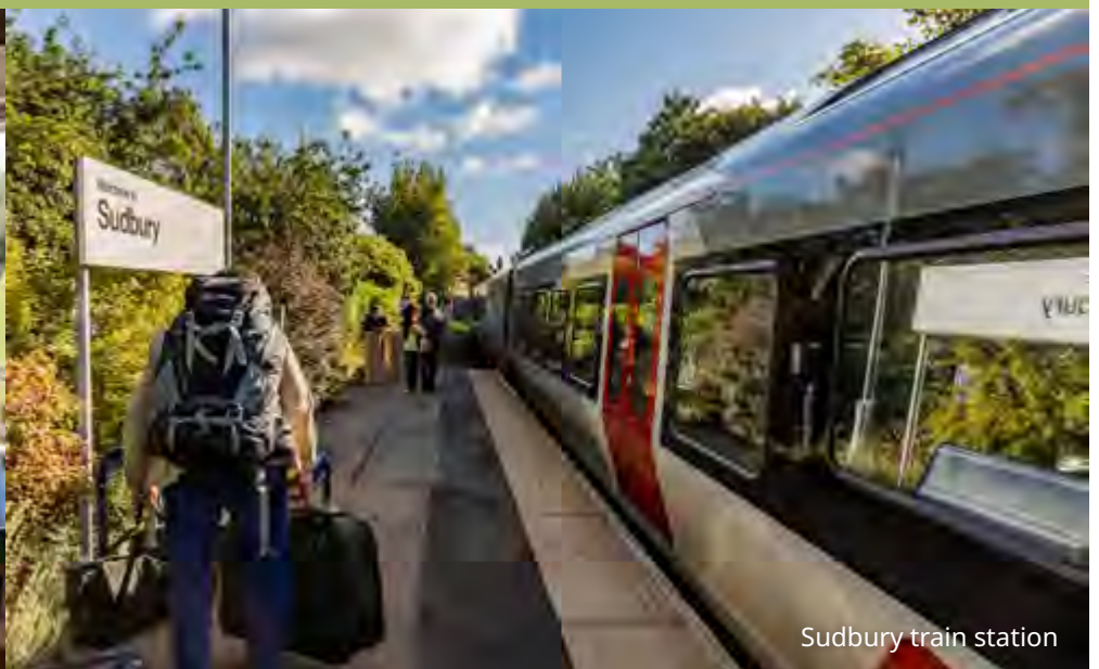
Sudbury train station