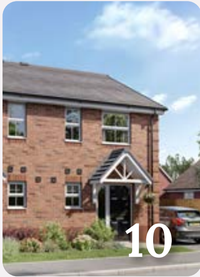
1 bedroom homes