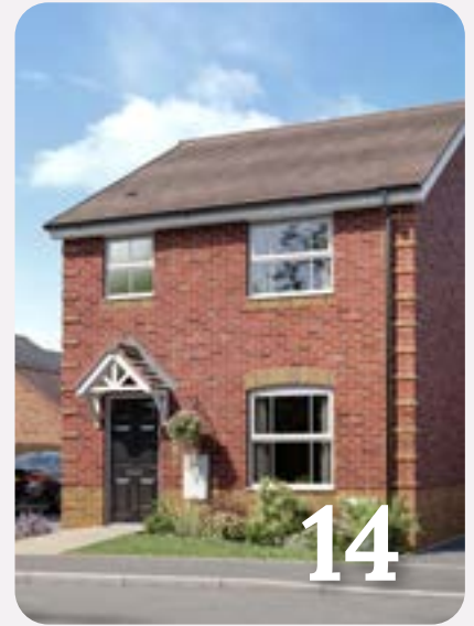
3 bedroom homes