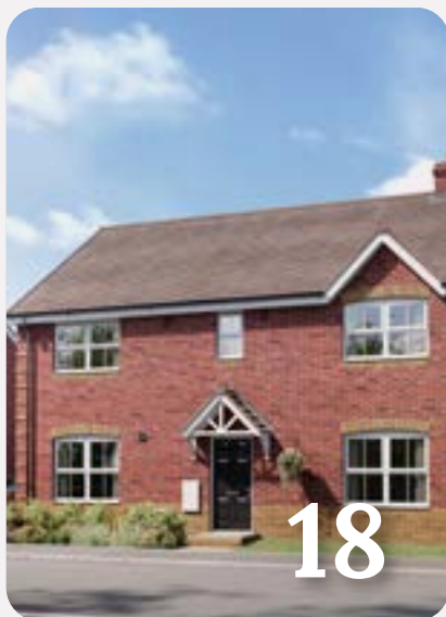
4 bedroom homes