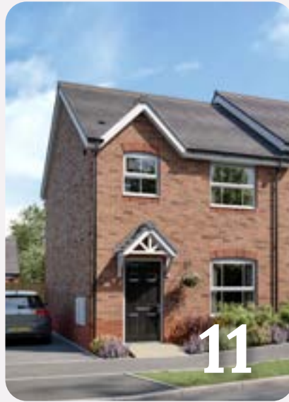
2 bedroom homes