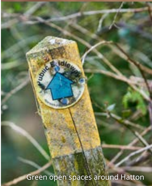
Green open spaces around Hatton