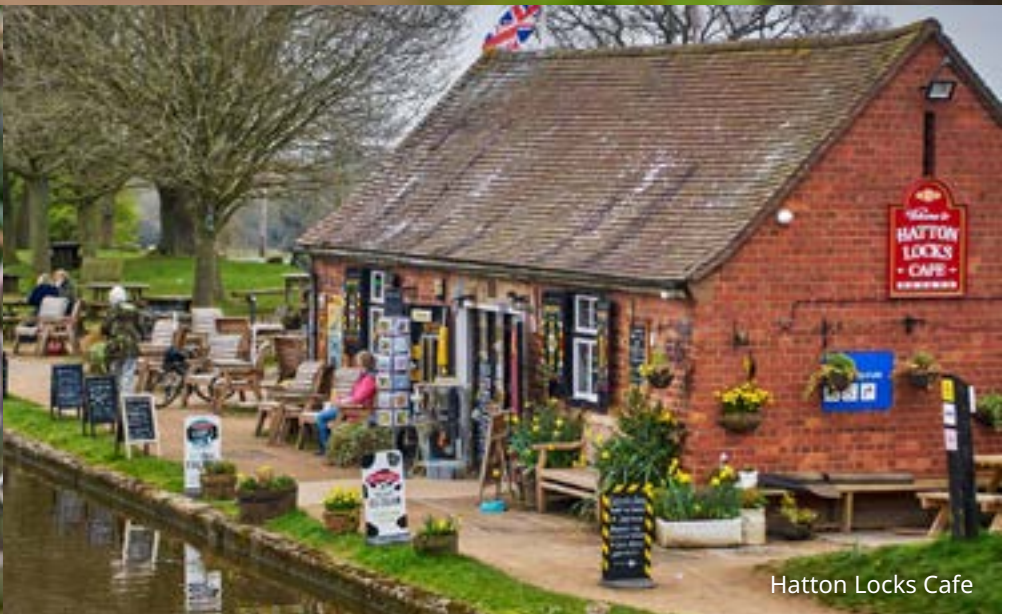
Hatton Locks Cafe