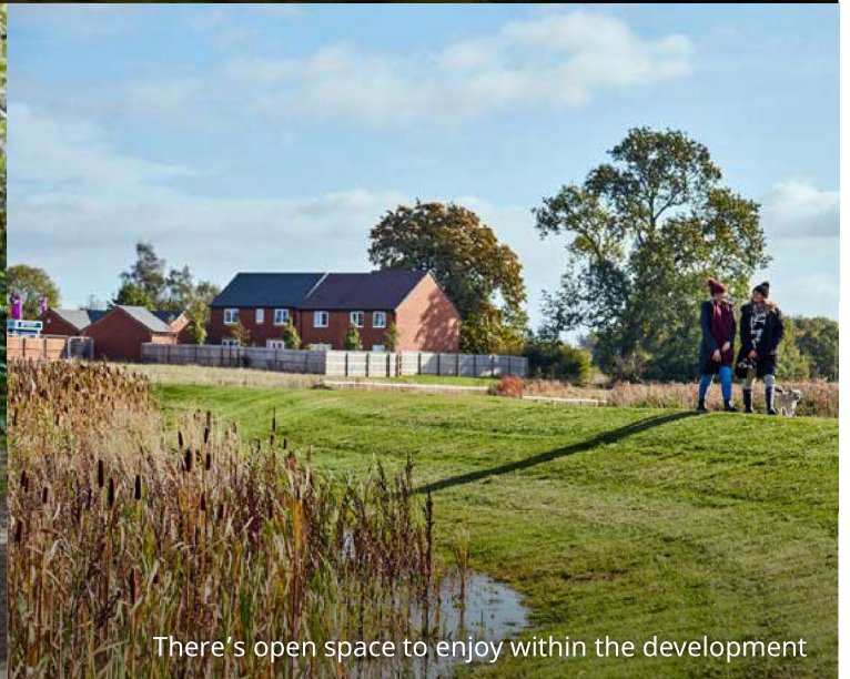
There's open space to enjoy within the development