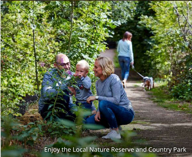
Enjoy the Local Nature Reserve and Country Park

Nearby city of Durham is full of historical charm