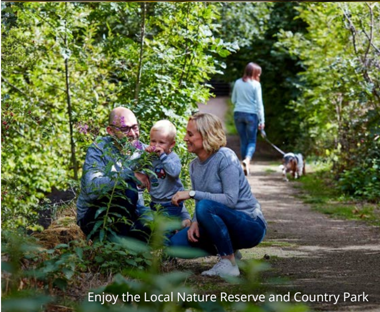
Enjoy the Local Nature Reserve and Country Park

Nearby city of Durham is full of historical charm