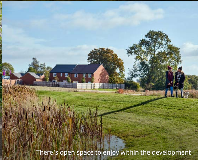
There's open space to enjoy within the development