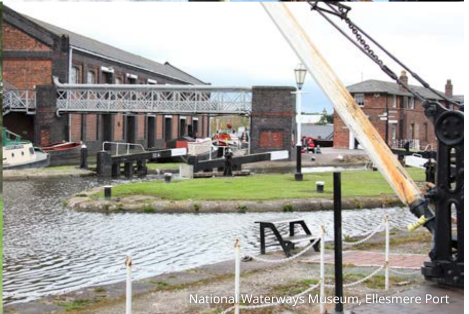
National Waterways Museum, Ellesmere Port