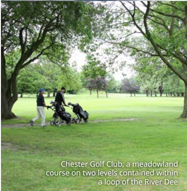
Chester Golf Club, a meadowland course on two levels contained within a loop of the River Dee