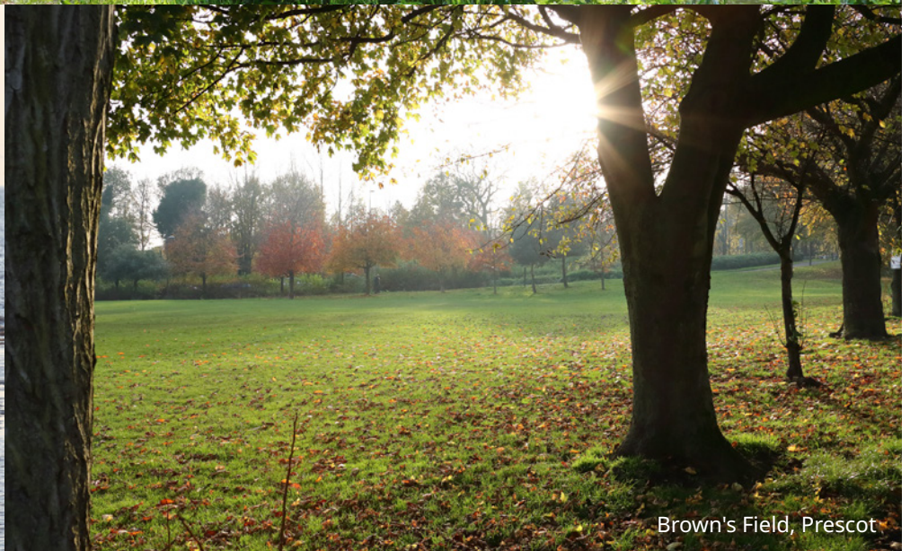
Brown's Field, Prescot