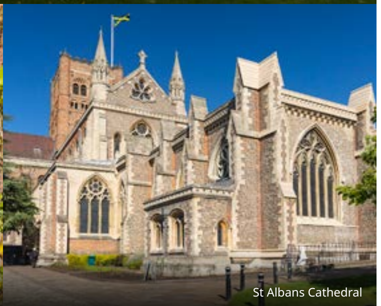
St Albans Cathedral