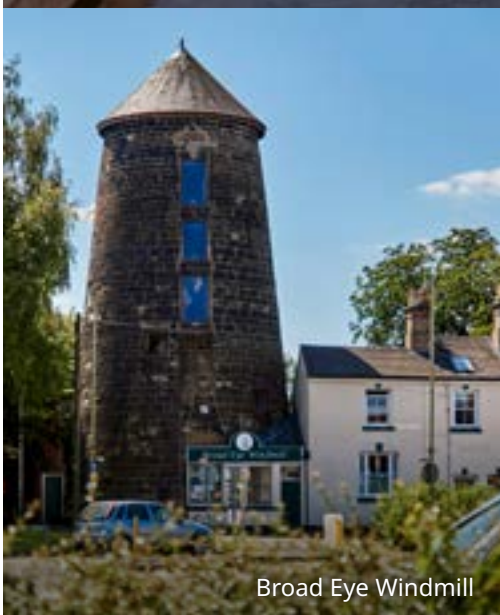
Broad Eye Windmill