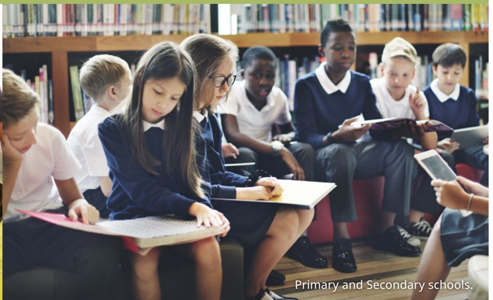
Primary and Secondary schools.