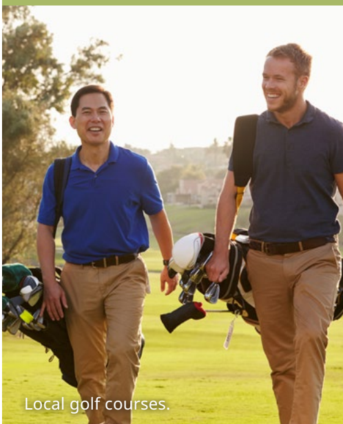
Local golf courses.