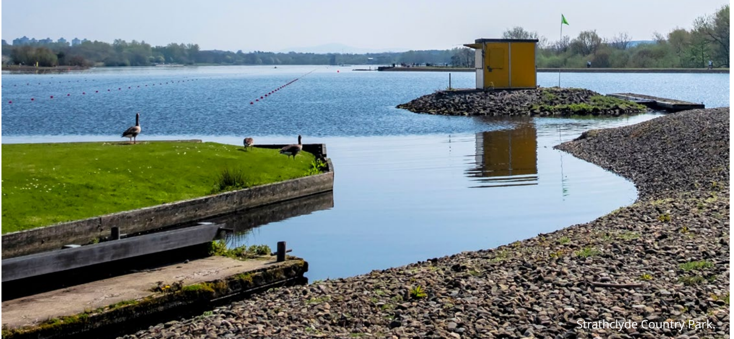
Strathclyde Country Park

Of course, home life is only part of the story. You'll want stress-free links to other parts of the country too. So, it's good to know that Torrance Place has excellent transport links with easy access to the M73, M74 and M8 to Glasgow and Edinburgh. Holytown train station is just 2 miles from the development and can whisk you into Glasgow Central Station in under 30 minutes, which is perfect for those who are looking to commute to the city.