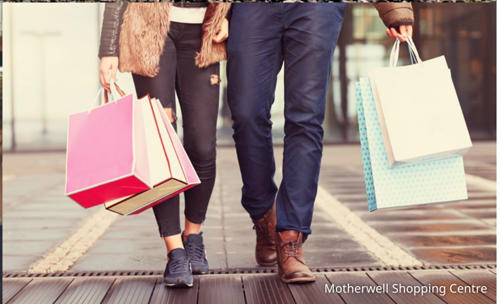
Motherwell Shopping Centre