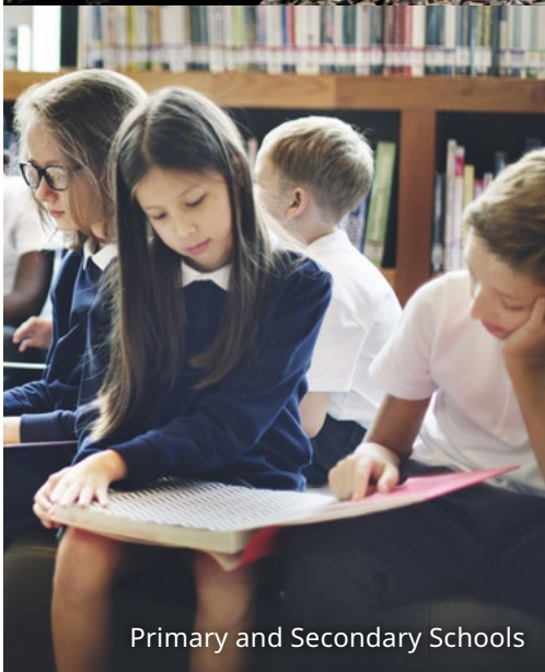
Primary and Secondary Schools