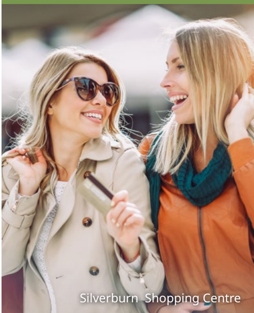
Silverburn Shopping Centre