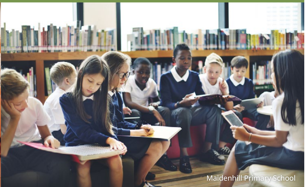
Maidenhill Primary School