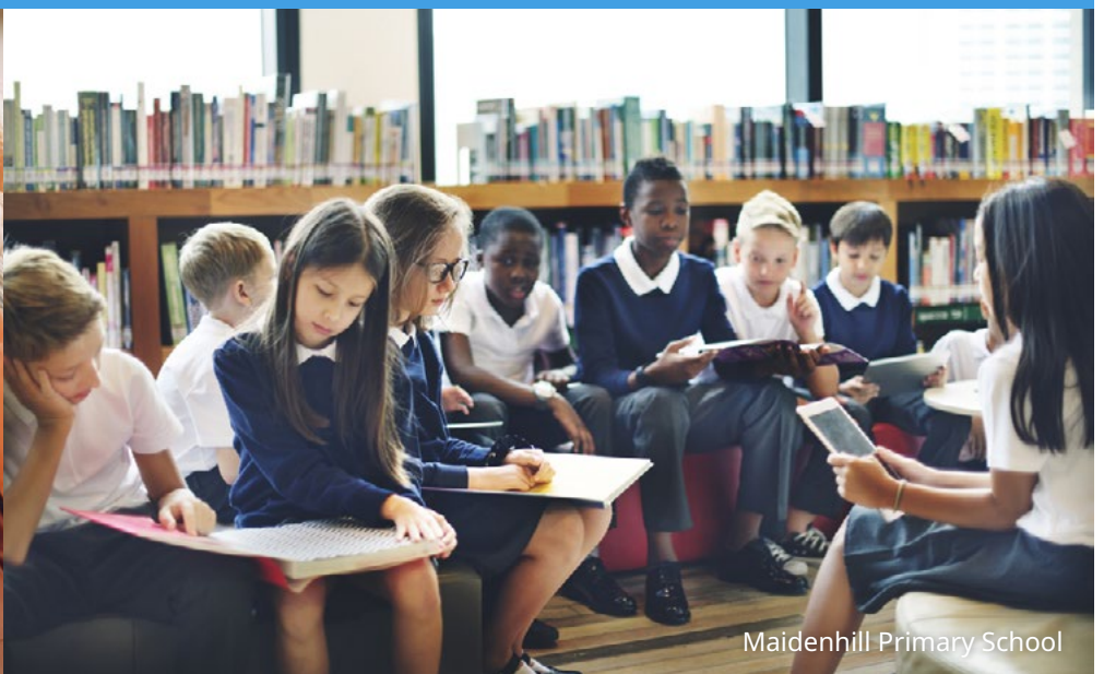
Maidenhill Primary School