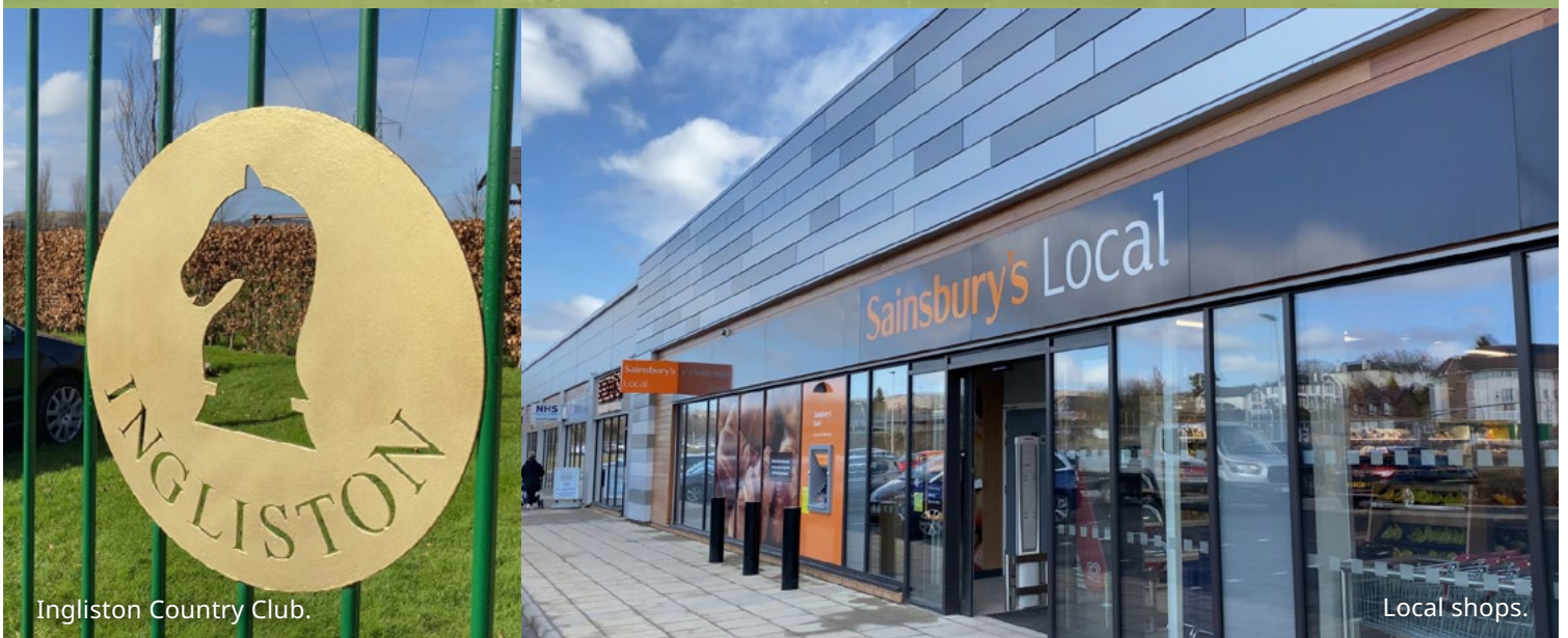
Ingliston Country Club.