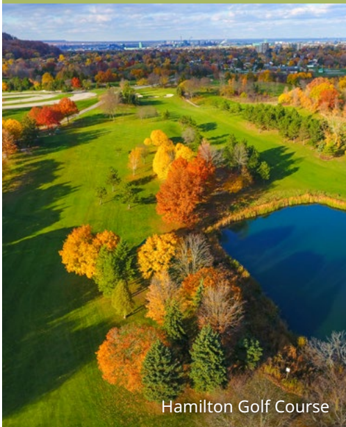
Hamilton Golf Course