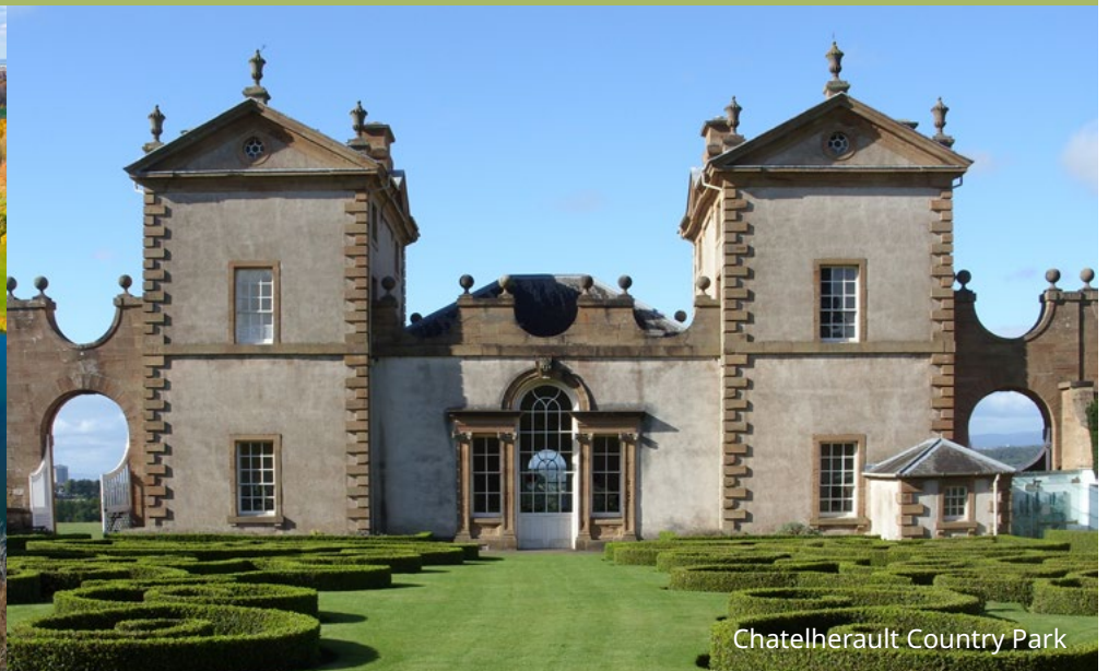
Chatelherault Country Park