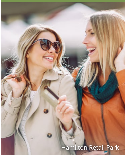
Hamilton Retail Park