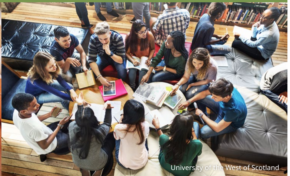
University of the West of Scotland