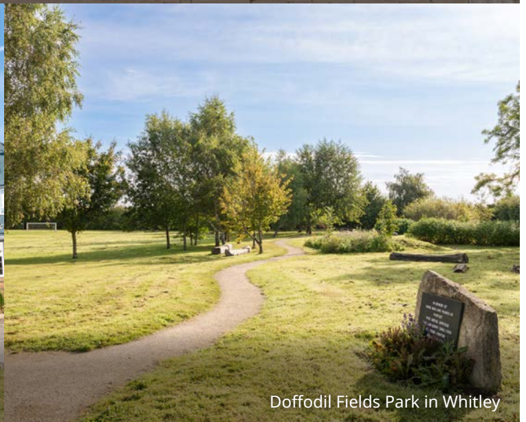
Doffodil Fields Park in Whitley