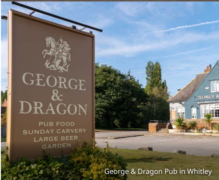
George & Dragon Pub in Whitley