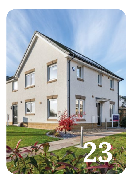
Take your next step