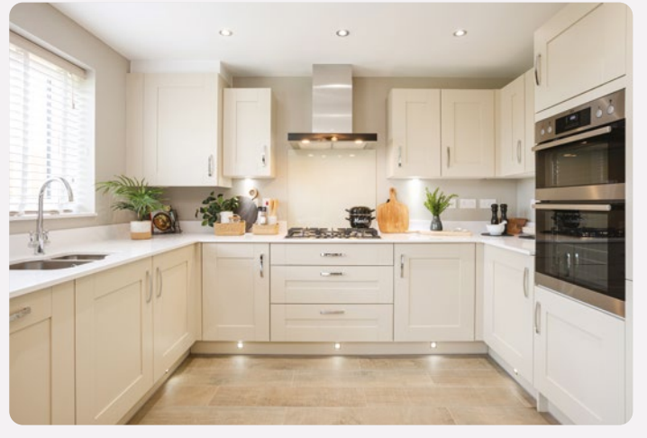
Options availability is subject to build stage of plots and options won't be available if plots have reached a certain build stage. Please contact the Sales Executive for further information.